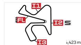
Circuito de Jerez - Ángel Nieto