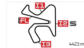
Circuito de Jerez - Ángel Nieto