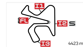
Circuito de Jerez - Ángel Nieto