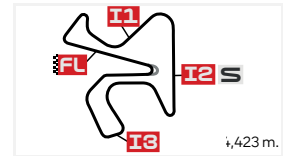
Circuito de Jerez - Ángel Nieto