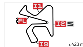
Circuito de Jerez - Ángel Nieto