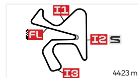
Circuito de Jerez - Ángel Nieto

ESTRELLA GALICIA O,O GRAND PRIX OF SPAIN QUALIFYING NR. 2