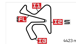
Circuito de Jerez - Ángel Nieto